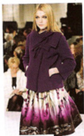
OSCAR DE LA RENTA

725 Originals $10 at Wal-Mart. Cotton and polyester. Sizes 1X to 4X. 1-800-328-0402 walmart.ca