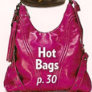
Hot Bags p. 30