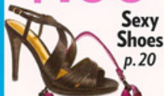
Sexy Shoes p. 20