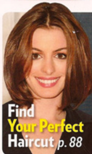
Find Your Perfect Haircut p. 88